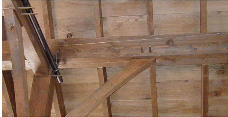
Figure 4 Applying a dark stain to green timbers will make checks appear more pronounced

stresses published in the supplement to the National Design Specification for Wood Construction (NDS) are based on the conservative assumption of the most severe checks, shake, or splits possible, as if the timber were split through its full thickness for its full length. Prior to the 2001 edition of the NDS, there were provisions in the standard that allowed for an increase in the allowable shear stress by a factor of 2.0 if you could verify that there were no splits or checks present at the end of the timber.