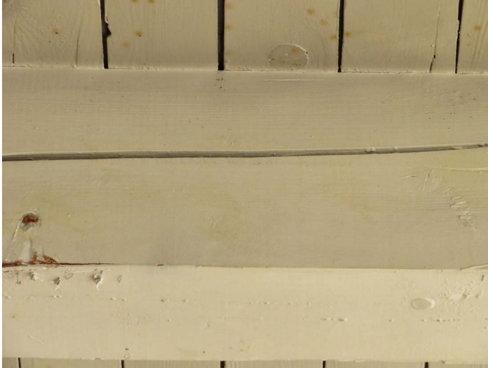
Figure 2 A single wide check on one tangential surface of a timber

The rate of drying affects the frequency and size of checks and depends on (1) the moisture content of the timber, or, more specifically, the moisture gradient across the cross section of the timber, and (2) the relative humidity in the air. Drying occurs much more rapidly at the exposed end grain than along the length of the timber. This is why end checks develop quickly as timbers dry. Often timbers for a project are initially longer than needed to allow for cutting the checked end grain from the timber before installation, once it is closer to being in equilibrium with the humidity in the environment. Checks are also impacted by the cut of the timber. The tangential face (plain sawn) exhibits the greatest shrinkage and typically a single wide check will develop, as shown in Figure 2. The radial face (vertical grain or quarter-sawn) will often have multiple narrow checks due to the lower radial shrinkage. Multiple short checks will also develop near the pith, as shown in Figure 3.